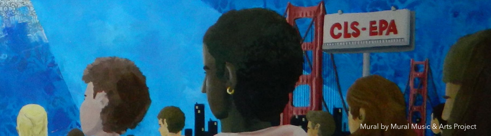
Mural by Mural Music & Arts Project